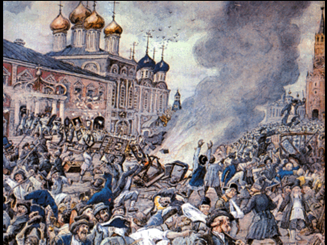
The Bubonic Plague – 14 th Century