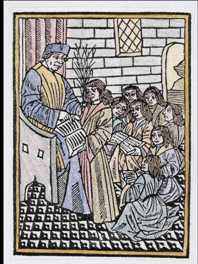
A Medieval Classroom