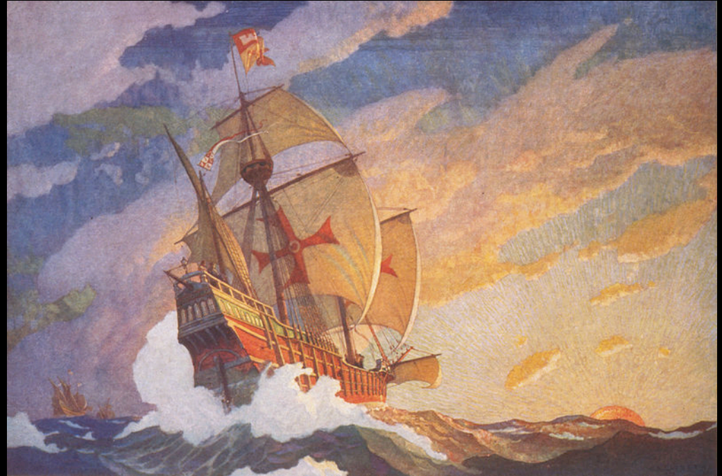
The Santa Maria – Columbus' Flagship